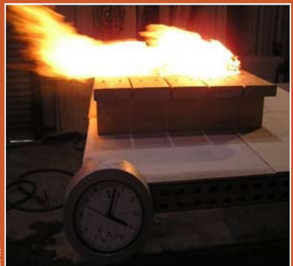
CA SFM 12-7A-4 Part B test for decking materials