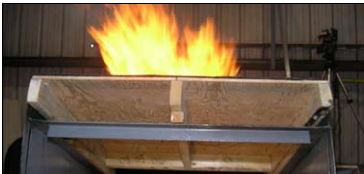
ASTM E108 (UL 790) test for roofing materials

SwRI has worked with the California State Fire Marshal (CA SFM), ASTM E05 and E14 subcommittees, and various commercial clients to promote the understanding of wildland-urban interface fires. These fires, typically characterized by quick spread due to ignition of dried vegetation, have plagued homeowners and insurance agencies for decades. As new standards are developed with fire exposures representative of actual forest fires, the risk of both property and life loss is greatly reduced.