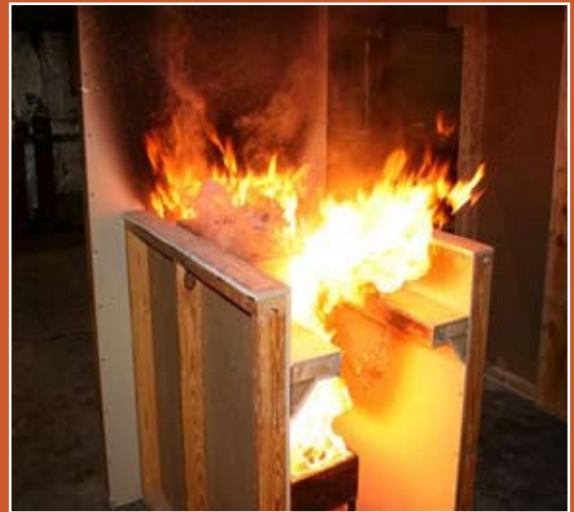
CA SFM 12-7A-4 Part A test for decking materials