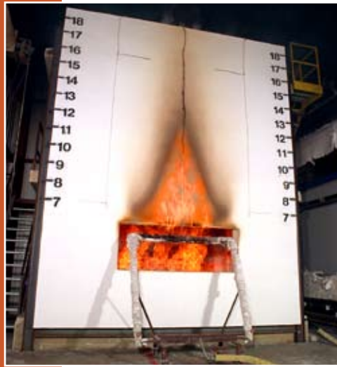
SwRI offers testing to NFPA 285 and ASTM E2307 utilizing its intermediate-scale, multi-story testing apparatus (ISMA)

SwRI has one of the few test laboratories in North America with equipment for performing NFPA 268, "Standard Test Method for Determining Ignitability of Exterior Wall Assemblies Using a Radiant Heat Energy Source," and NFPA 285, "Standard Fire Test Method for Evaluation of Fire Propagation Characteristics of Exterior Non-load-bearing Wall Assemblies Containing Combustible Components," in one location.