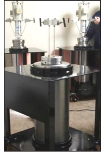
SwRI's HPHT autoclaves are used to expose different types of polymeric compounds to simulated in-service hazardous environments.

The 6,500-square-foot Mechanical Engineering Performance Laboratory has 36 tensile test frames dedicated to the mechanical testing of materials. SwRI engineers and technologists conduct standard and customized tests to assess the performance of polymeric dumbbell specimens before and after an exposure test. Typical tests and standards are listed below.