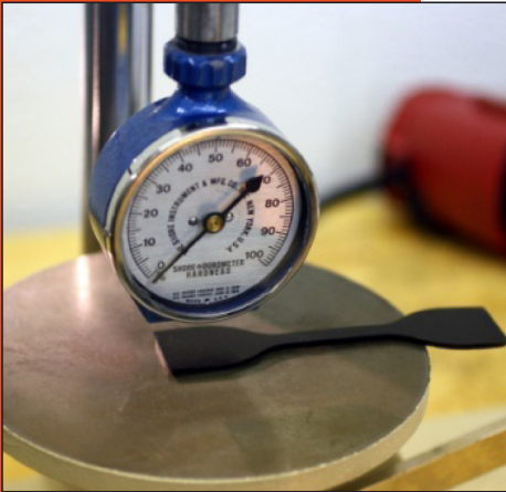
Hardness measurements are evaluated on various types of polymeric specimens before and after an exposure test.