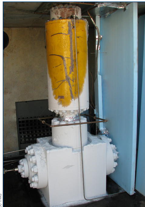
Valve and hydraulic actuator assembly undergoing low-temperature (-50°F) test