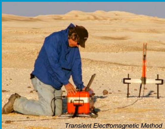
Transient Electromagnetic Method